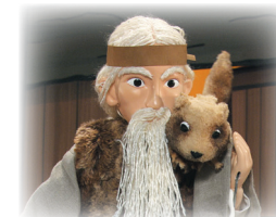
Meeting God on the mountain