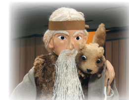
Meeting God on the mountain