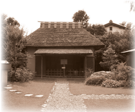
The barn where Heikichi was with God (Oogoe, Kazo-city, Saitama)