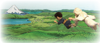
Flying through the mountains with God